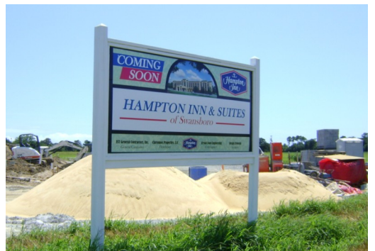
The Hampton Inn & Suites will be located off Old Hammock Road in Swansboro near the intersection with NC Highway 24, and is expected to open in March 2011.

The project development team says if all goes well, the Hampton